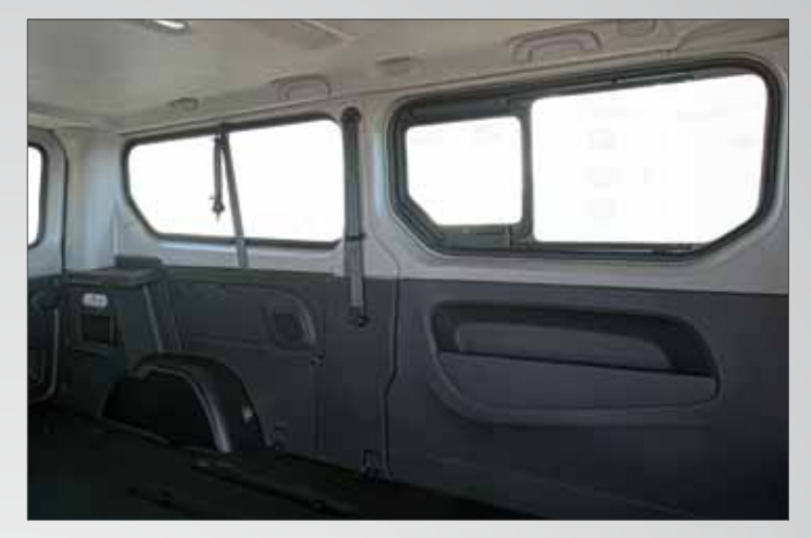
Window covers and wheel arch cover.