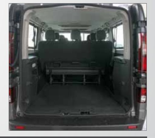
Third-row bench covers and wheel arch covers. The lower covers are designed to be tilted, easing the storage of long equipment.

HOMOLOGATION Focaccia Group's homologation department is in direct contact with the main body builders and with the Italian Ministry of Transport, guaranteeing compliance with the European norms and safety criteria of the original vehicle.