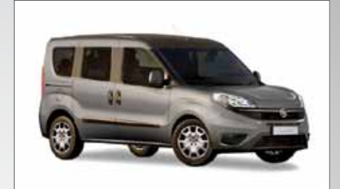
FIAT DOBLÒ / OPEL COMBO