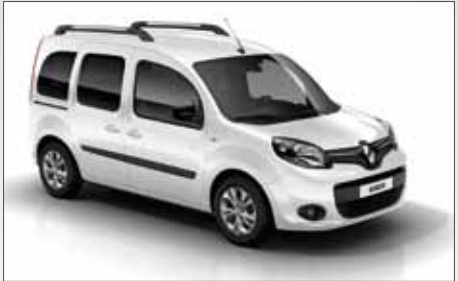
RENAULT KANGOO / MERCEDES CITAN