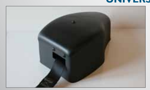
REAR MOTOR F-WINCH