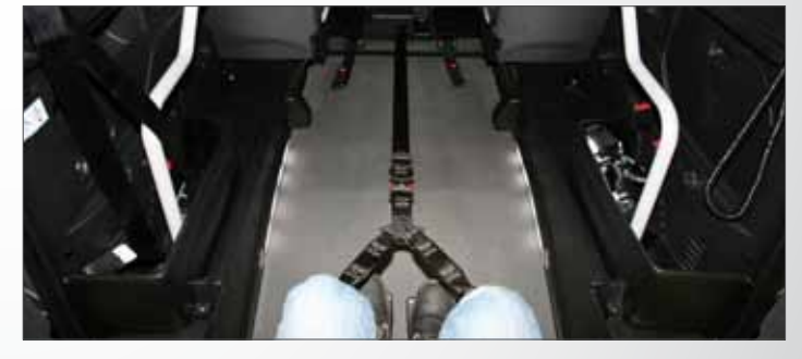
F-Winch is nicely integrated within your car and it's designed to provide maximum confidence and safety to all passengers.