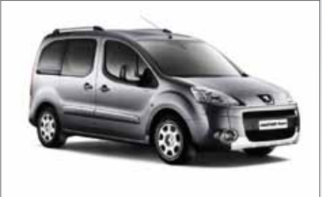
PEUGEOT PARTNER / CITROEN BERLINGO